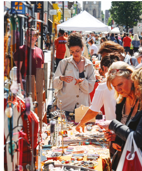
Celebrating Bold Street