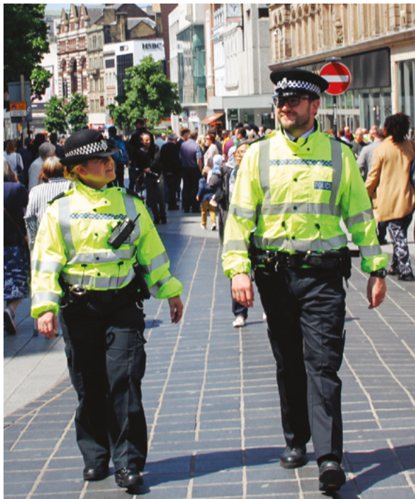
BID Police Officers