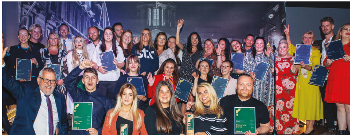
Mystery Shop Awards 2019