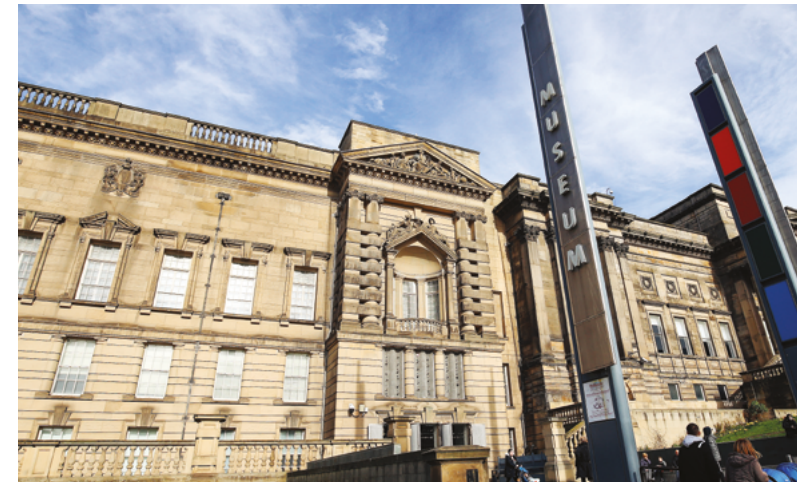
St George's Quarter